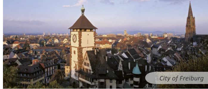
City of Freiburg

Students can take the 3 credit hour course ILAS 2350 "Introduction to Liberal Studies", a learning how to learn course, a hybrid course with seminars interspersed between cultural and sightseeing activities. The online portion of the class students will complete from their homes in December before the trip. Students from any department, college or university can participate.