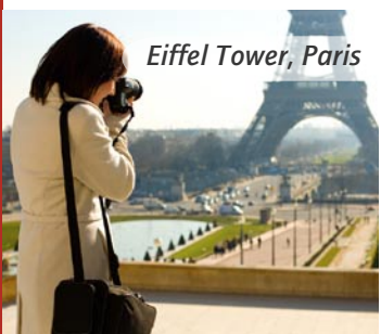
Eiffel Tower, Paris

Itinerary is subject to change depending on availability.