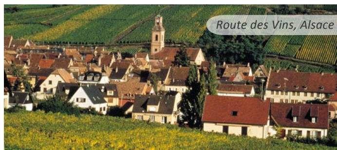
Route des Vins, Alsace