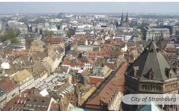
City of Strasbourg

For more information about the program, contact: